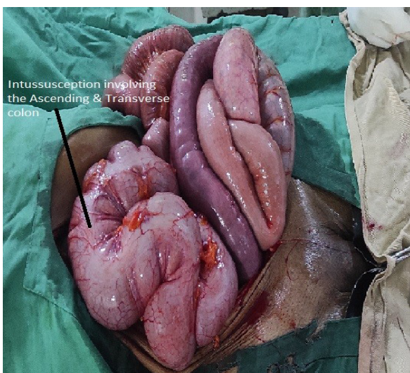
Figure 1: Intussusception in situ.

Intra-operatively, we found the invagination of the terminal ileum, proximal part of the vermiform appendix and caecum into the ascending and transverse colon. The intussusceptum extended up to the splenic flexure (Figures 1-3). The right iliac fossa was empty and there was 300 mls of serosanguinous fluid