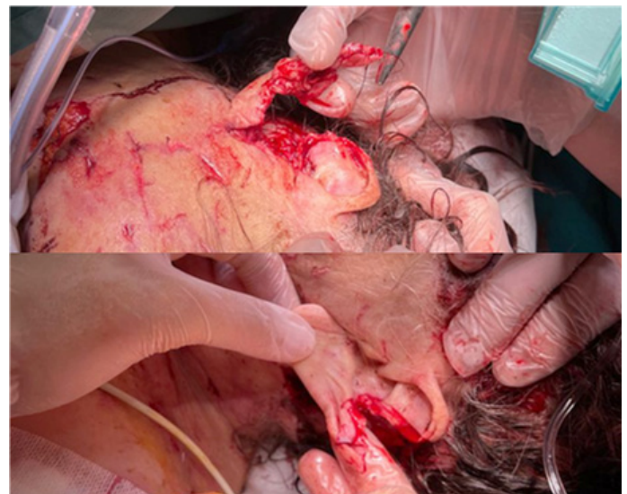
Figure 1: Intra-operative sub-amputated right auricle (up) and lacerated left auricle (down).

We believe that an early but controlled steroid therapy could prevent the onset of severe edema that could compromise the already precarious vitality of the traumatized tissues preserved by the debridement.