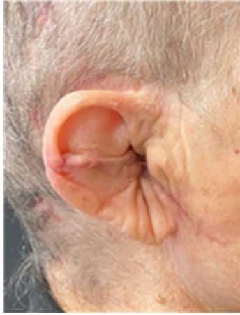
Figure 2: 1-month post-operative right auricle.

Moreover, a controlled steroid therapy not only contributes to a reduction of tissue harmful oedema but allows to do so without risks in terms of infections sequelae, especially in animal bites injuries.